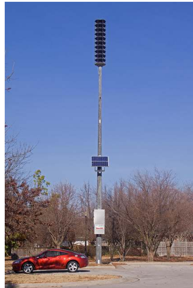
Whelen WPS-2910 Electronic Siren with Solar Power