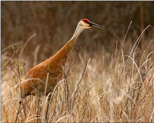
Cranes roost at night in area marshes including Haehnle Sanctuary where up to 5,000 may be seen in October and November.

Late in the summer, Sandhills abandon their nesting territories and flock to staging areas like the Haehnle Sanctuary. Staging areas typically provide abundant food, protected night roosting sites and the benefits of congregating in flocks during migration. Here the routes and traditions of older, experienced birds can be passed on to less experienced individuals.