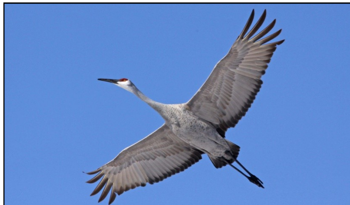
The Crane above flies with its neck out stretched in typical crane fashion. Great blue heron fly with their necks in an S curve and their heads resting on their shoulders.

Cranes leave the sanctuary around sunrise to feed in nearby farm fields. They begin to return one to two hours before sunset. During the day, flocks can be located by driving the roads within 5 miles of their roosting sites.