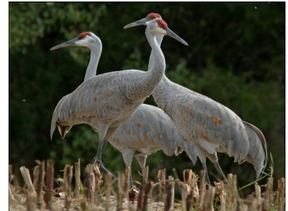
Cranes appear brown most of the year, but turn gray when they molt in the fall. The brown color is acquired by preening in the marsh waters.

Living Dinosaurs: Sandhill Cranes hold the record as the oldest living bird species. A fossil wing bone of a Sandhill was found in the Nebraskan deposit dating back 9 million years. Fossils from other members of the Order that cranes belong to, Gruiformes, date back some 60 million years at a time when dinosaurs roamed the earth.